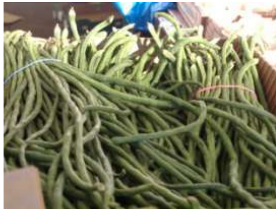
Yard long beans